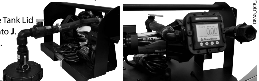
Completed front and back views

Step 10: Take out the 2" plug in the 6" Cage Tank Lid and thread J into the Tank Lid and thread K into J . Make the final connection with the cam locks.