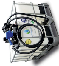
135 TOP MOUNT BOTTOM DRAW