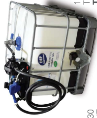
275 / 330 TOP MOUNT BOTTOM DRAW