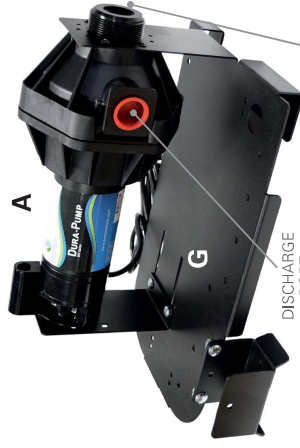
275 / 330 SIDE MOUNT BOTTOM DRAW