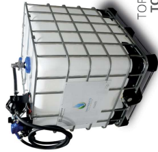
275 / 330 TOP MOUNT TOP DRAW