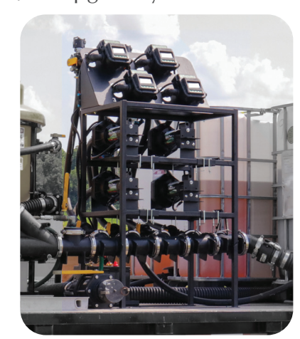
Direct inject herbicides into the carrier flow.

Don't mortgage the farm to automate your filling process!! Just upgrade your current 2" or 3" system.