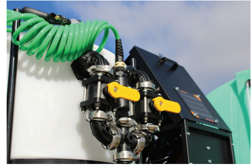
40 Gallon Cone with chem knife and rinse