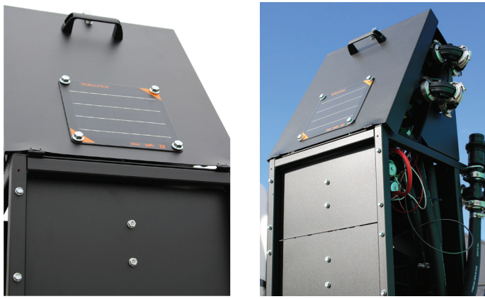
Protective Meter Lid & Solar Panel