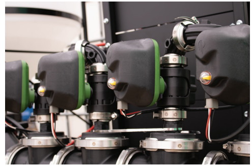
Dura 1" Electric Valves