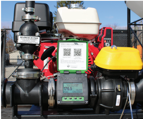
Auto-Batch™ High-Flow Carrier System