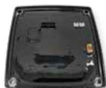
Moisture sealed circuitry.