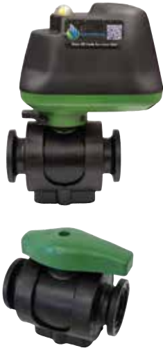
Valve available with manual handle

Dura electric valves undergo rigorous field testing to ensure they are not only waterproof and durable but also maintenance-free and long-lasting. Every component, from the actuator housings to the electrical and valve parts, is meticulously designed and manufactured at Dura with your needs in mind.