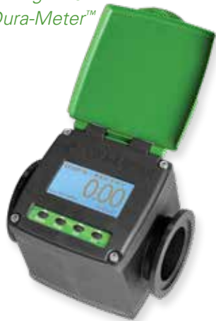
2" High-Flow Dura-Meter™