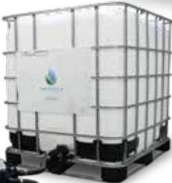
GROUND Easy Caddy used from the ground