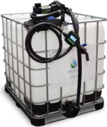
TOP MOUNT Easy Caddy secured on top of tote