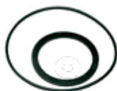
AG Dura-Pump™ Gasket Kit

DP-G4001A-V Viton® DP-G4001A-E EPDM DP-G4001A-S Silicone