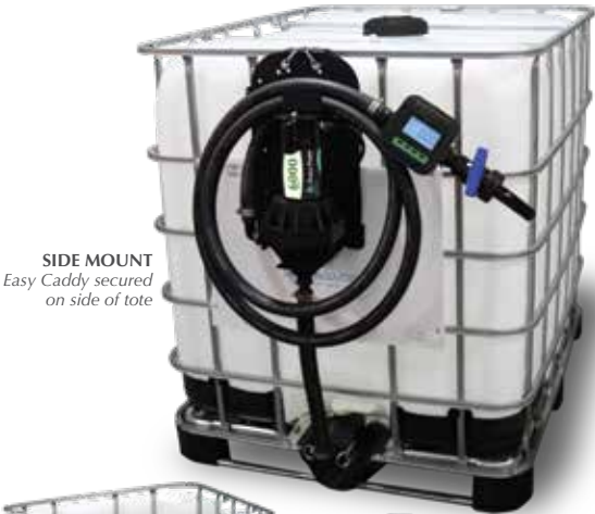
SIDE MOUNT Easy Caddy secured on side of tote