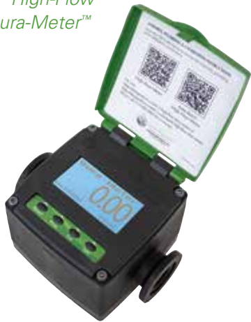
1" High-Flow Dura-Meter™