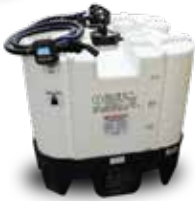
SNYDER TANK Easily converted to a GEM Cap