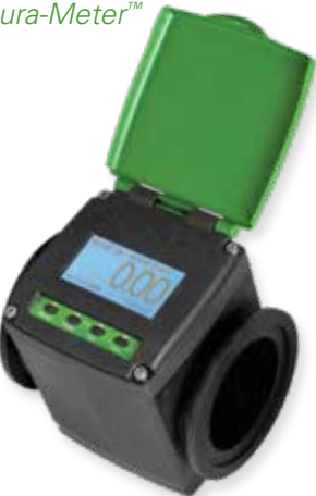
3" High-Flow Dura-Meter™