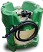
MONSANTO TANK Easily converted to a MTS