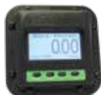
AG Dura-Meter™ Chemical Face Plate

DP-P6017A-V Viton® DP-P6017A-E EPDM DP-P6017A-S Silicone