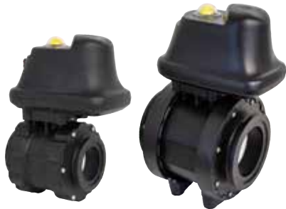
Can be used Without mounting bracket

New designs in 2" and 3" full port with 1.5 seconds response time and removable mounting brackets that allow for different mounting configurations.