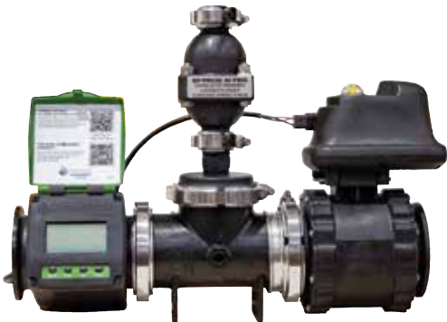
Configuration can vary based on system set up.