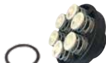
AG Dura-Pump™ Cartridge Kit with O-Ring and Bottom Gasket

DP-H4001A-V Viton® DP-H4001A-E EPDM DP-H4001A-S Silicone