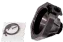
AG Dura-Pump™ Bottom Housing Kit with Bottom Gasket and Screws

DP-G4001A-V Viton® DP-G4001A-E EPDM DP-G4001A-S Silicone