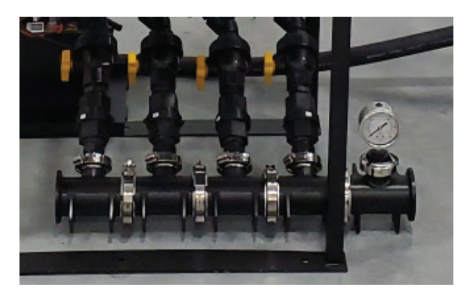
Dura Auto-Batch™ Direct Injection 2" Kit Assembly