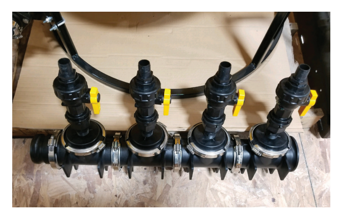
Dura Auto-Batch™ Direct Injection 3" Kit Assembly