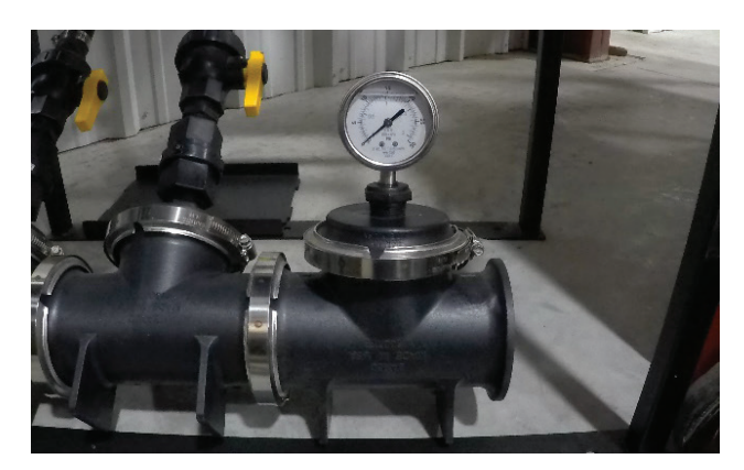
Dura Auto-Batch™ Direct Injection 3" Gauge Assembly

You may also view assembly videos on our website.