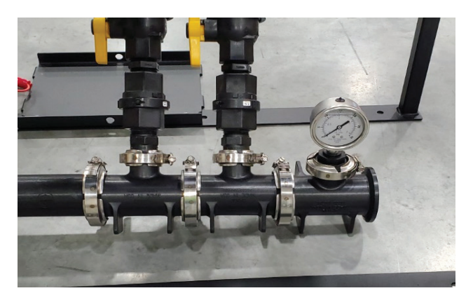
Dura Auto-Batch™ Direct Injection 2" Gauge Assembly