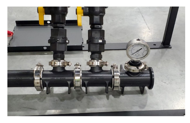
Dura Auto-Batch™ Direct Injection 2" Gauge Assembly