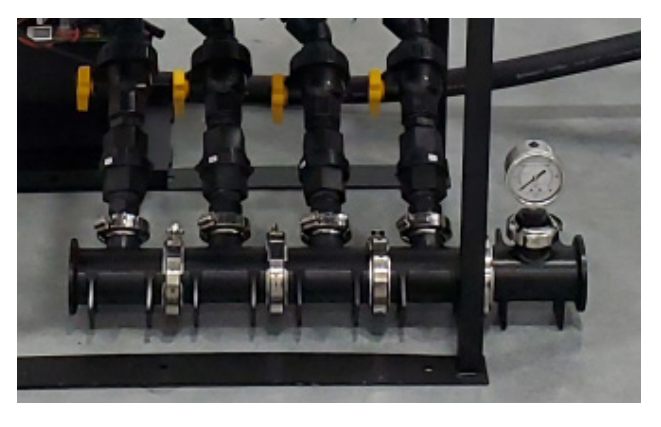
Dura Auto-Batch™ Direct Injection 2" Kit Assembly