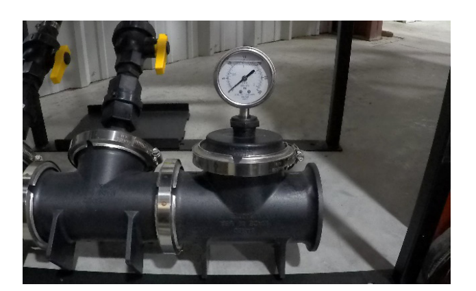
Dura Auto-Batch™ Direct Injection 3" Gauge Assembly

You may also view assembly videos on our website.