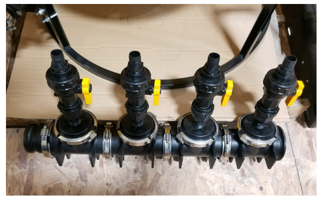
Dura Auto-Batch™ Direct Injection 3" Kit Assembly