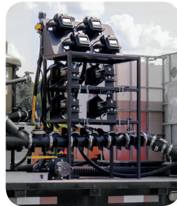
Direct inject herbicides into the carrier flow.

Don't mortgage the farm to automate your filling process!! Just upgrade your current 2" or 3" system.