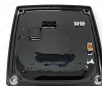
Moisture sealed circuitry.