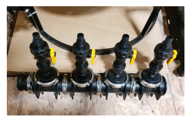
Dura Auto-Batch™ Direct Injection 3" Kit Assembly