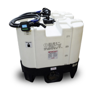
SNYDER TANK Easy Caddy to a GEM Cap