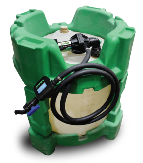
MONSANTO TANK Easy Caddy to a MTS